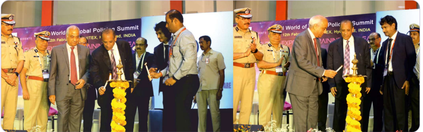
Hon'ble Governor of Telangana & Andhra Pradesh Sri. E.S.L. Narasimhan lights the lamp and inaugurates the DIGIPOL Summit 2019 in the presence of other dignitaries