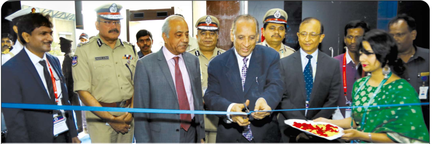
Hon'ble Governor of Telangana & Andhra Pradesh Sri. E.S.L. Narasimhan Inaugurating the DIGIPOL Summit Expo in the presence of other dignitaries