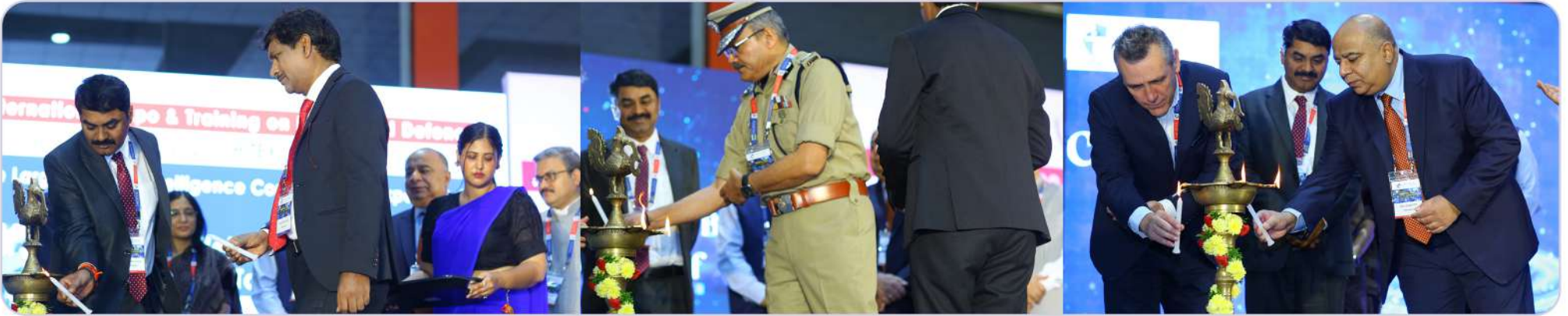
Scientific Adviser to Defense Minister Government of India Dr. G. Satheesh Reddy lightens the lamp and inaugurates the DIGIPOL 2023 in the presence of other dignitaries.