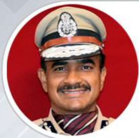
Shri C V Anand IPS

Commissioner of Police - Hyderabad, Government of Telangana