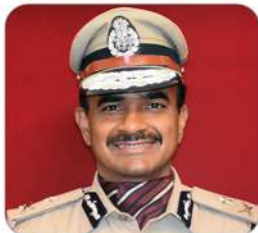
Sri C V Anand IPS Commissioner of Police - Hyderabad Government of Telangana