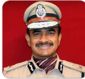
Sri C V Anand IPS Commissioner of Police - Hyderabad Government of Telangana